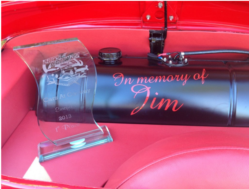
As the fuel tank says "In memory of Jim"